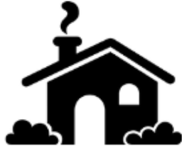
YOUR POTENTIAL CUSTOMER

The New Resident Mailing is sent quarterly to new homeowners in 63123 & 63125 welcoming them to our area. It's a great way to put YOUR BUSINESS in THEIR HOME!