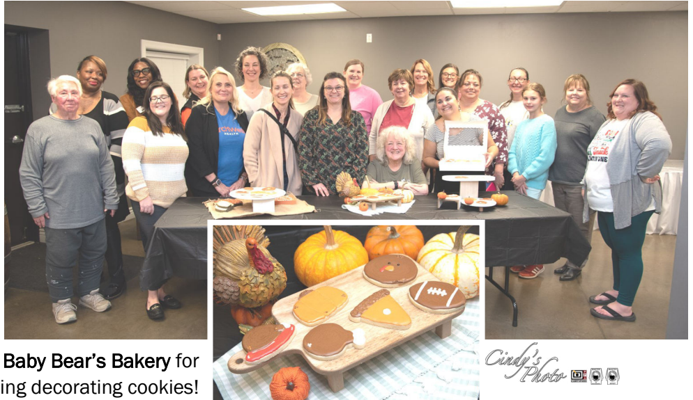
Thanks to Baby Bear's Bakery for a great evening decorating cookies!