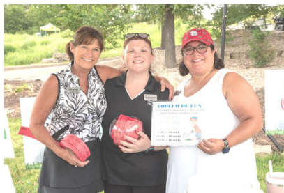
Delmar Gardens/Garden Villas South