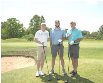
Flight B—First Place Pasta House