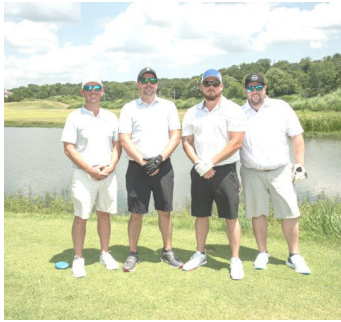
Flight A—First Place Reinhold Electric