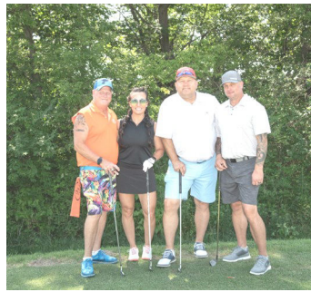
Flight A—Second Place St. Louis Co. Police—South Co. Precinct